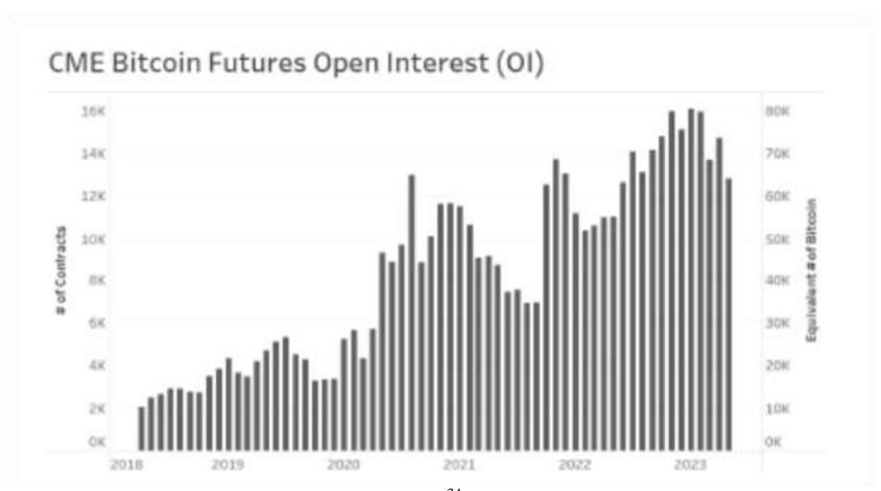
The number of large open interest holders<sup>34</sup> and unique accounts trading bitcoin futures have both increased, even in the face of heightened bitcoin price volatility.