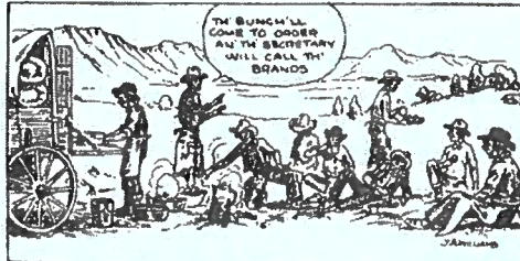
CATTLE GROWERS IN SESSION, YAVAPAI COUNTY, ARIZONA