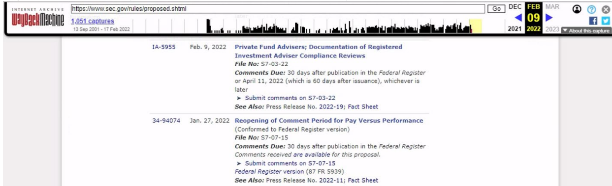
Figure 3: Screenshot of the SEC’s proposed rules on February 9, 2022.

17