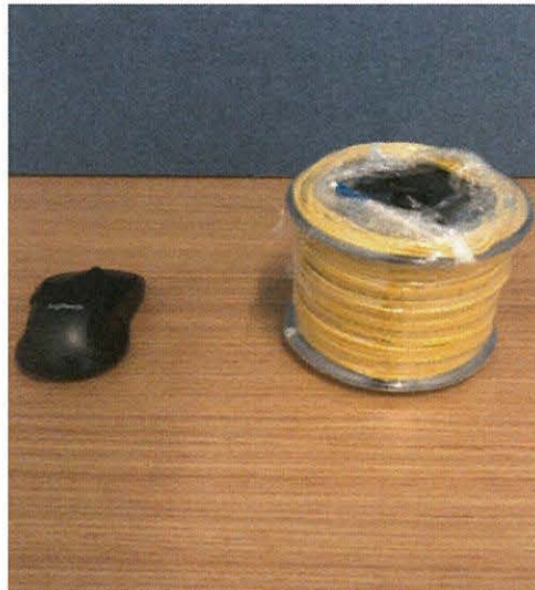
Fig. 1. NASDAQ-SM-100M-Reel 100 Meters SM NASDAQ SPEC

The actual physical cable the Exchanges use in their data centers to provide direct access to their systems is not unique or specialized from a technology standpoint. In fact, it is widely available from various vendors. Virtu obtained a quote from a vendor and purchased the very same cable for $189.50. As noted on the invoice pictured below, the cable is described as “NASDAQ-SM-100M-Reel 100 Meters SM NASDAQ SPEC” and is pictured below ( figures 1 & 2 below ). Virtu was also able to purchase the same cable on Amazon for a mere $87.95. Using the Amazon price, Virtu could purchase 13,507 of these cables (which are 328 feet in length) and string a line of continuous cable from Nasdaq’s data center in Carteret, New Jersey to the CME Group Data Center in Aurora, Illinois and have enough cable left to traverse to Madison, Wisconsin.