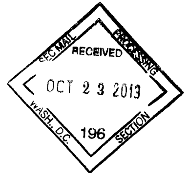
Exhibit 99.3.1 to the Pre-Effective Amendment No. 1 to the Form S-1 (Electronic Report, Schedule or Registration Statement of Which the Documents Are a Part (Give Period of Report))

333-191125 (SEC File Number, if Available)