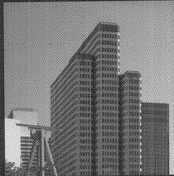
2100 Ross DALLAS, TX