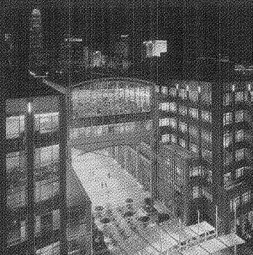
Gateway Village CHARLOTTE, NC