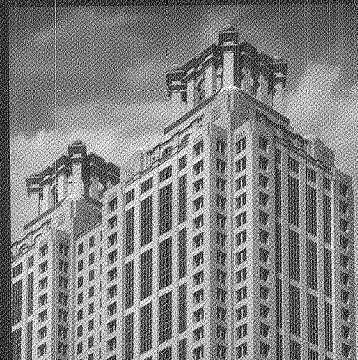
191 Peachtree ATLANTA, GA