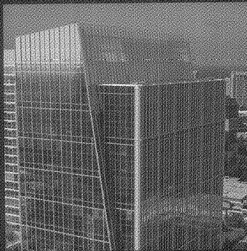
Terminus 200 ATLANTA, GA