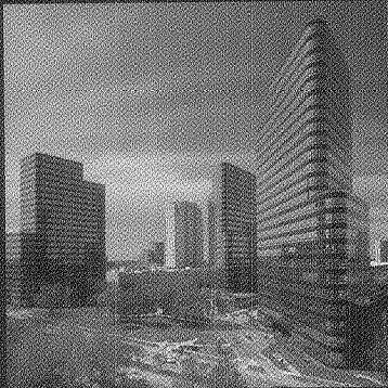
Post Oak Central HOUSTON, TX