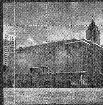
American Cancer Society Center ATLANTA, GA