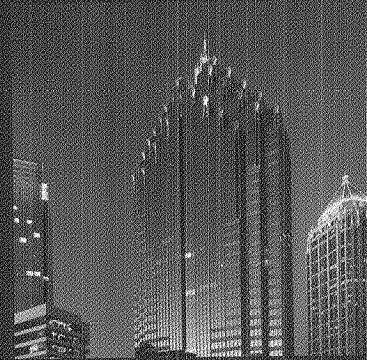
Promenade ATLANTA, GA