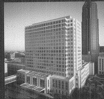
Emory Univ. Hospital Midtown ATLANTA, GA