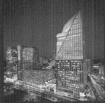
Terminus 100 ATLANTA, GA