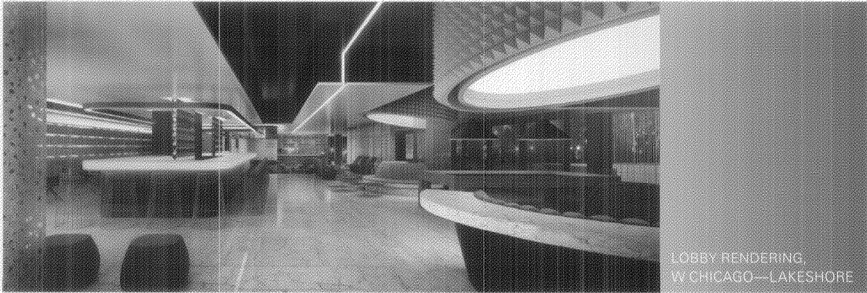
LOBBY RENDERING, W CHICAGO—LAKESHORE

Since our last letter to you, we have successfully expanded and strengthened our balance sheet with attractive equity and debt financings. With the support of our shareholders, we raised $419 million of net proceeds from favorable preferred and common share offerings. Additionally, we have taken advantage of historically low interest rates by securing $162 million of fixed-rate mortgage debt and by amending our revolving credit facility to reduce our cost of borrowings by 100 basis points, increase its size and flexibility, and extend its term.