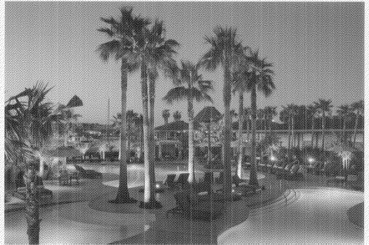
CLOCKWISE FROM TOP LEFT: W CHICAGO—CITY CENTER, LE MERIDIEN SAN FRANCISCO, HYATT REGENCY MISSION BAY SPA AND MARINA, THE HOTEL MINNEAPOLIS, AUTOGRAPH COLLECTION