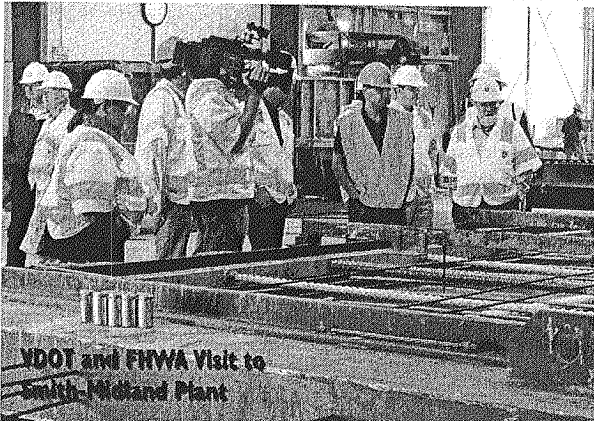
YDOT and FHWA Visit to Smith-Midland Plant