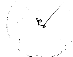
GENERAL MANAGER (Shares & Bonds)

हिंदी मे पत्राचार का हम स्वागत करते है, हमें विश्वास है कि ऐसा करने से हिंदी के प्रयोग को बढावा मिलेगा.