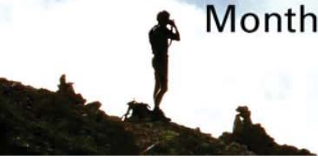
HSBC Vantage5 Index Simulated & Historical Returns