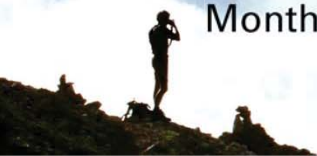
HSBC Vantage5 Index Simulated & Historical Returns