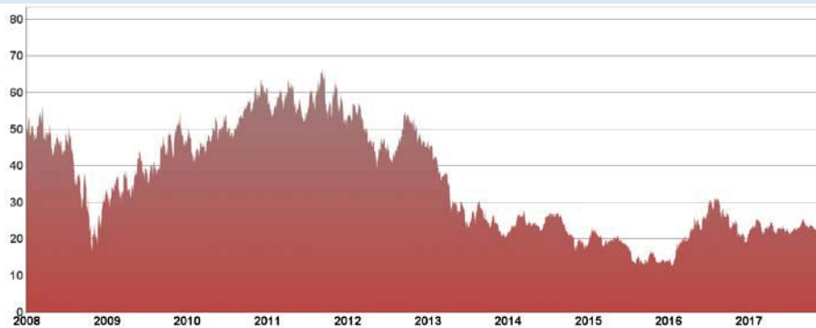
Historical Performance of the GDX – Daily Official Closing Prices January 2, 2008 to December 15, 2017

The following graph sets forth the historical performance of the GDX based on the daily historical official closing prices from January 2, 2008 through December 15, 2017. We obtained the official closing prices below from the Bloomberg Professional ® service. We have not independently verified the accuracy or completeness of the information obtained from the Bloomberg Professional ® service. The historical prices of the GDX should not be taken as an indication of future performance, and no assurance can be given as to the price of the GDX on the valuation date.