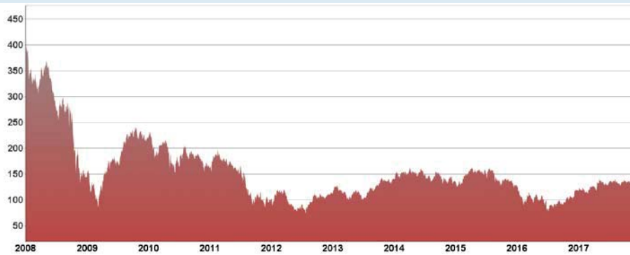
Historical Performance of the SX7E – Daily Official Closing Levels January 2, 2008 to December 15, 2017

The following graph sets forth the historical performance of the SX7E based on the daily historical official closing level from January 1, 2008 through December 15, 2017. We obtained the official closing levels below from the Bloomberg Professional ® service. We have not independently verified the accuracy or completeness of the information obtained from the Bloomberg Professional ® service. The historical levels of the SX7E should not be taken as an indication of future performance, and no assurance can be given as to the level of the SX7E on the valuation date.