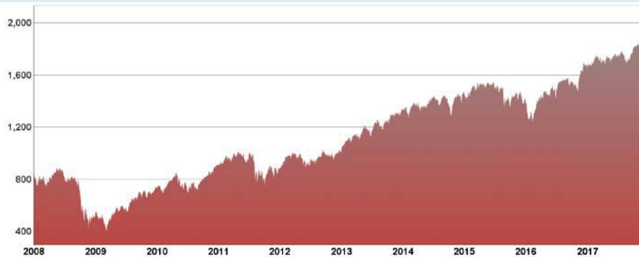
Historical Performance of the MID – Daily Official Closing Levels January 1, 2008 to December 15, 2017

The following graph sets forth the historical performance of the MID based on the daily historical official closing level from January 1, 2008 through December 15, 2017. We obtained the official closing levels below from the Bloomberg Professional ® service. We have not independently verified the accuracy or completeness of the information obtained from the Bloomberg Professional ® service. The historical levels of the MID should not be taken as an indication of future performance, and no assurance can be given as to the level of the MID on the valuation date.