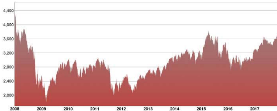
Historical Performance of the SX5E – Daily Official Closing Levels January 1, 2008 to December 15, 2017

The following graph sets forth the historical performance of the SX5E based on the daily historical official closing level from January 1, 2008 through December 15, 2017. We obtained the official closing levels below from the Bloomberg Professional ® service. We have not independently verified the accuracy or completeness of the information obtained from the Bloomberg Professional ® service. The historical levels of the SX5E should not be taken as an indication of future performance, and no assurance can be given as to the level of the SX5E on the valuation date.