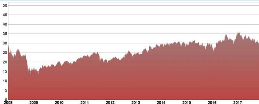
Historical Performance of the IYZ – Daily Official Closing Prices January 2, 2008 to December 15, 2017

The following graph sets forth the historical performance of the IYZ based on the daily historical official closing prices from January 2, 2008 through December 15, 2017. We obtained the official closing prices below from the Bloomberg Professional ® service. We have not independently verified the accuracy or completeness of the information obtained from the Bloomberg Professional ® service. The historical prices of the IYZ should not be taken as an indication of future performance, and no assurance can be given as to the price of the IYZ on the valuation date.