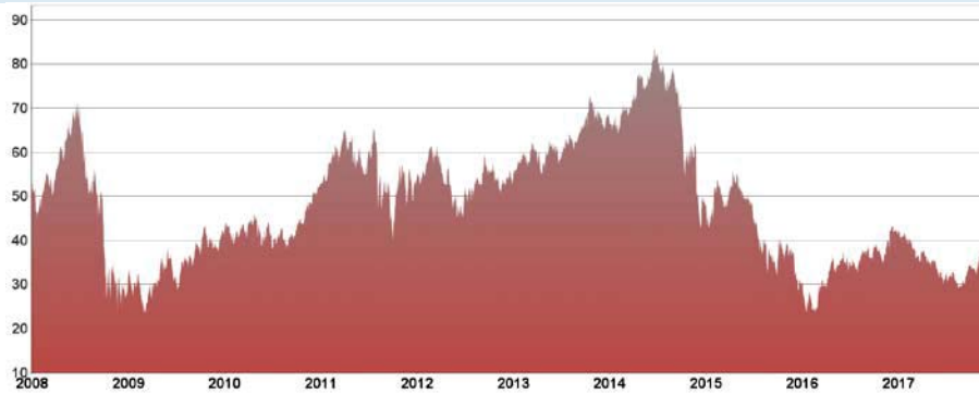
Historical Performance of the XOP – Daily Official Closing Prices January 2, 2008 to December 15, 2017

The following graph sets forth the historical performance of the XOP based on the daily historical official closing prices from January 2, 2008 through December 15, 2017. We obtained the official closing prices below from the Bloomberg Professional ® service. We have not independently verified the accuracy or completeness of the information obtained from the Bloomberg Professional ® service. The historical prices of the XOP should not be taken as an indication of future performance, and no assurance can be given as to the price of the XOP on the valuation date.