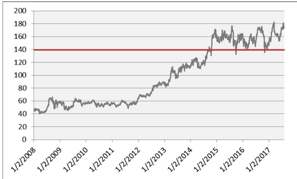
Amgen Inc. – Daily Closing Prices January 2, 2008 to August 2, 2017

*The red solid line indicates the hypothetical downside threshold, assuming the closing price of the underlying shares on August 2, 2017 were the initial share price.