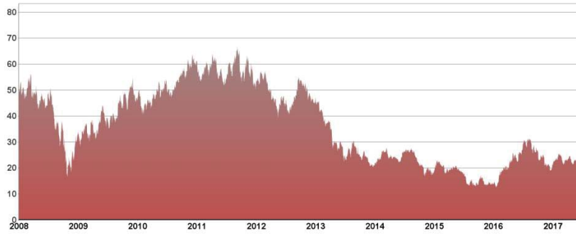
Market Vectors® Gold Miners ETF – Daily Closing Prices January 1, 2008 to July 14, 2017

Based on the Performance of Market Vectors® Gold Miners ETF Principal at Risk Securities