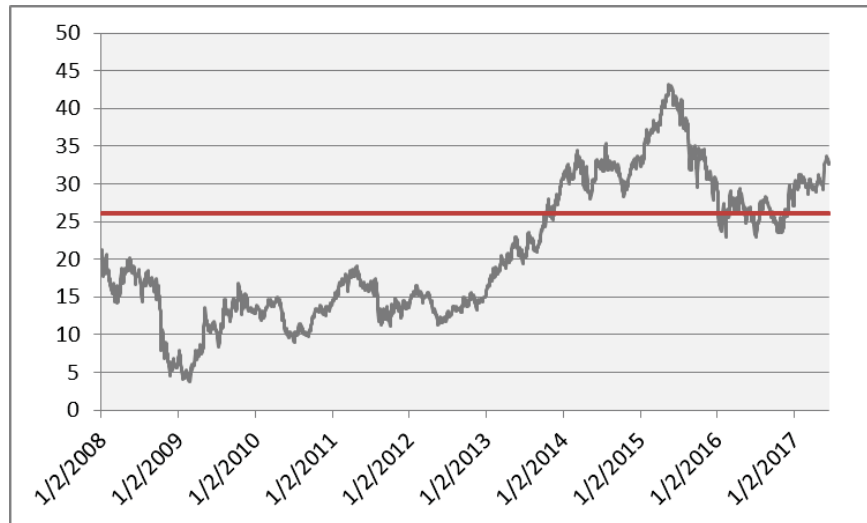
The Blackstone Group L.P. – Daily Closing Prices January 2, 2008 to June 16, 2017

*The red solid line indicates the downside threshold level.