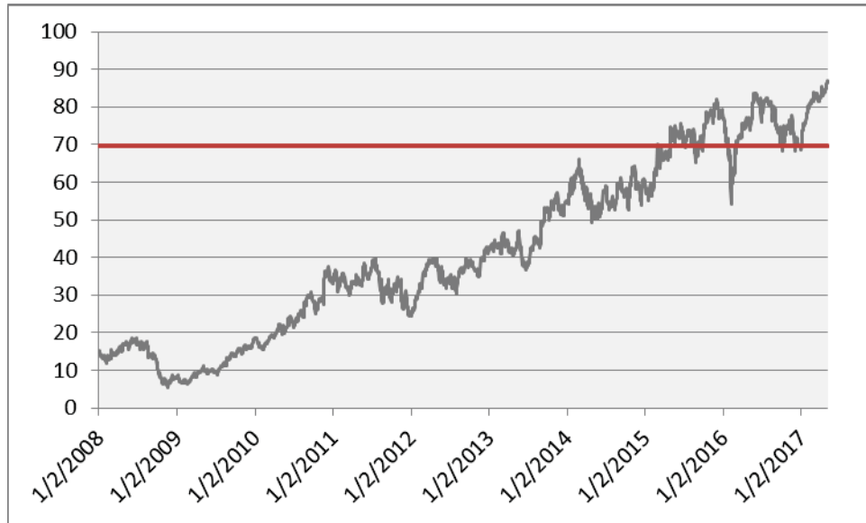
Salesforce.com, inc. – Daily Closing Prices January 2, 2008 to May 5, 2017

*The red solid line indicates the downside threshold level.