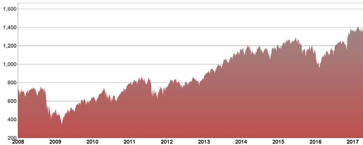
Historical Performance of the Russell 2000® Index

The following graph sets forth the historical performance of the RTY based on the daily historical closing levels from January 1, 2008 through April 28, 2017 as reported on the Bloomberg Professional® service. We have not undertaken any independent review of, or made any due diligence inquiry with respect to, the information obtained from the Bloomberg Professional® service.