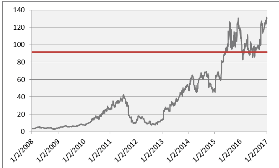
Netflix, Inc. – Daily Closing Prices January 2, 2008 to January 11, 2017

*The red solid line indicates the hypothetical downside threshold level, assuming the closing price of the underlying shares on January 11, 2017 were the initial share price.