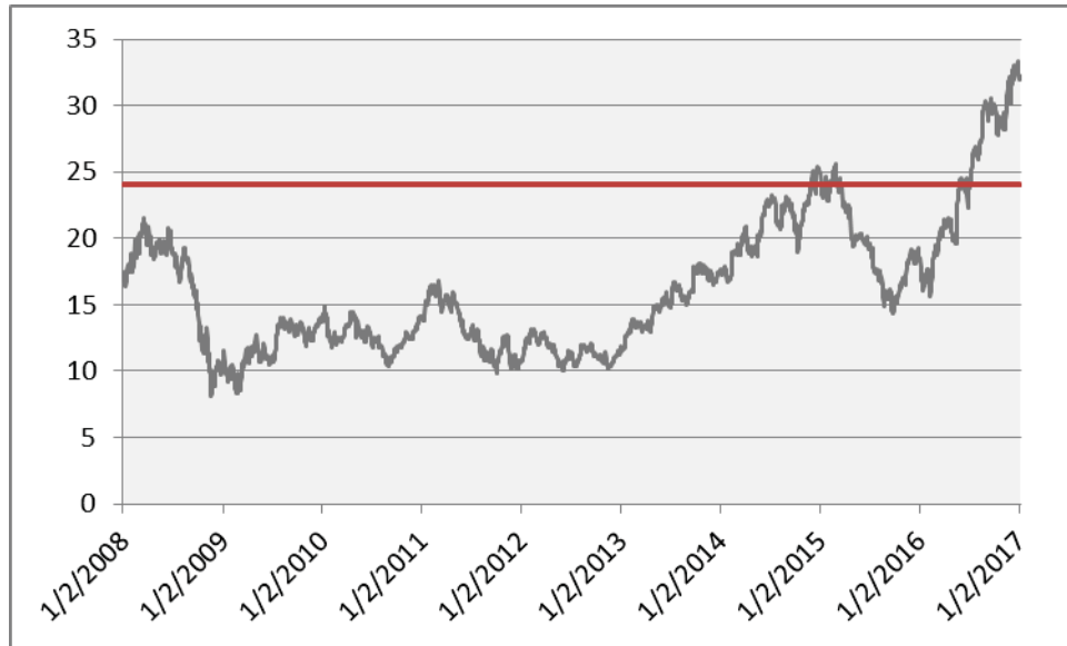
Applied Materials, Inc. – Daily Closing Prices January 2, 2008 to January 6, 2017

*The red solid line indicates the downside threshold level.