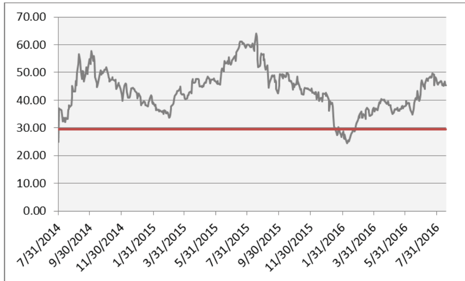
Mobileye N.V. – Daily Closing Prices July 31, 2014 to August 17, 2016

*The red solid line indicates the hypothetical downside threshold level, assuming the closing price of the underlying shares on August 17, 2016 were the initial share price.