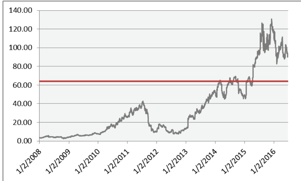
Netflix, Inc.– Daily Closing Prices January 2, 2008 to June 23, 2016

*The red solid line indicates the hypothetical downside threshold level, assuming the closing price of the underlying shares on June 23, 2016 was the initial share price.