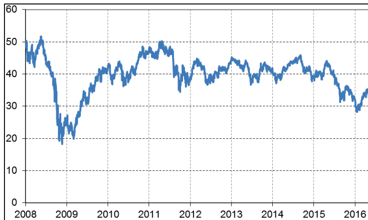
Historical Performance of the iShares® MSCI Emerging Markets ETF

The graph below shows the daily historical closing prices of the Underlier from January 1, 2008 through June 16, 2016. We obtained the closing prices in the graph below from Bloomberg Financial Services, without independent verification.