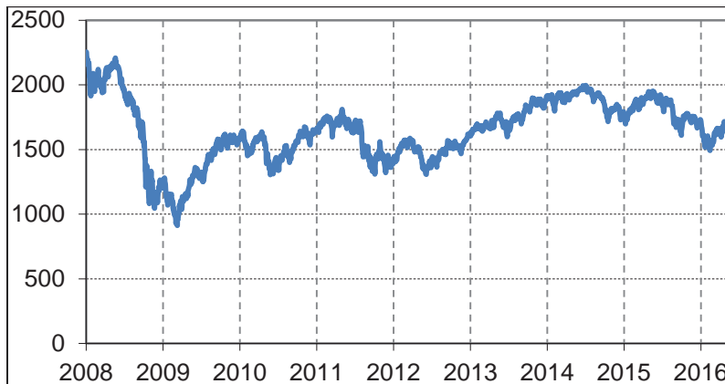
Historical Performance of the MSCI EAFE® Index

The graph below shows the daily historical closing levels of the Underlier from January 1, 2008 through June 8, 2016. We obtained the closing levels in the graph below from Bloomberg Financial Services, without independent verification.