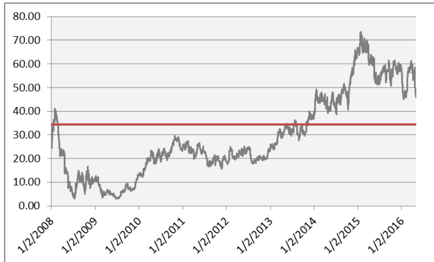
United Continental Holdings, Inc. – Daily Closing Prices January 2, 2008 to April 29, 2016

*The red solid line indicates the downside threshold level.