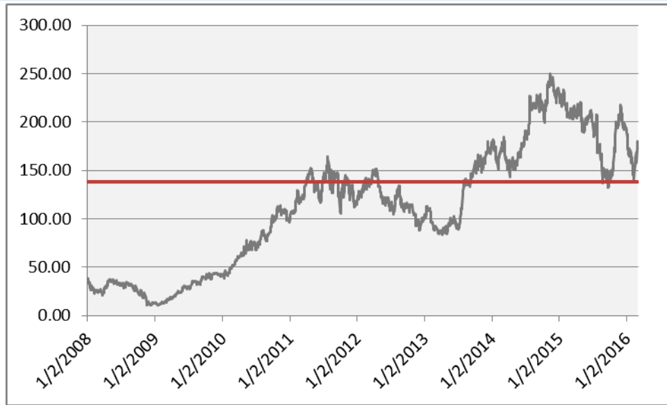
Baidu, Inc. – Daily Closing Prices January 1, 2008 to April 5, 2016

*The red solid line indicates the hypothetical downside threshold level, assuming the closing price of the underlying shares on April 5, 2016 was the initial share price.