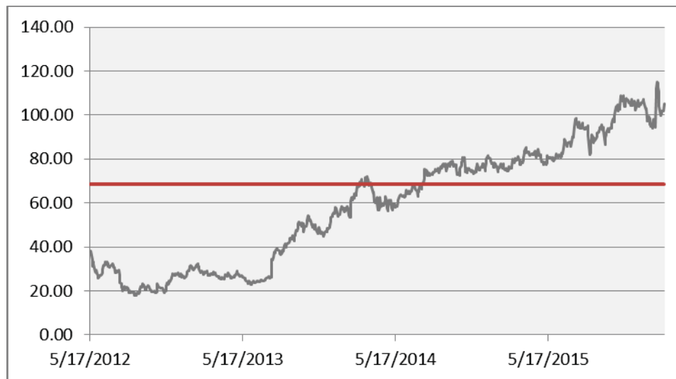
Facebook Inc. – Daily Closing Prices May 17, 2012 to February 17, 2016

*The red solid line indicates the hypothetical downside threshold level, assuming the closing price of the underlying shares on February 17, 2016 were the initial share price.