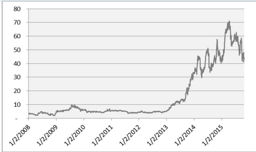
Common Stock of Lannett Company, Inc. – Daily Closing Prices January 1, 2008 to January 6, 2016