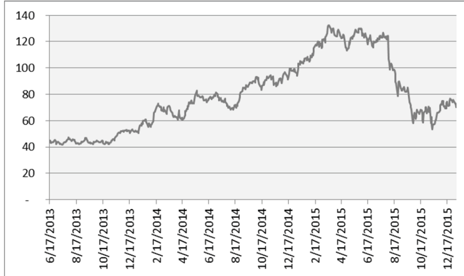
Ordinary Shares of Mallinckrodt Public Limited Company – Daily Closing Prices June 17, 2013 to January 6, 2016