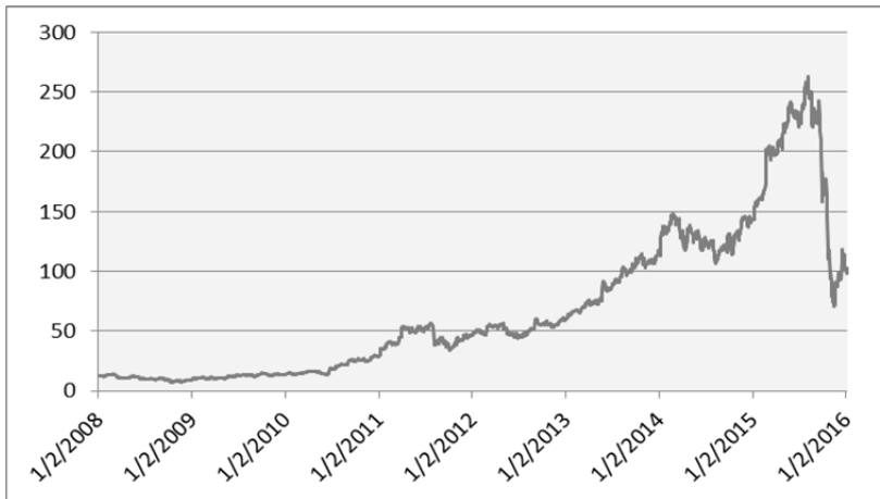
Common Shares of Valeant Pharmaceuticals International, Inc. – Daily Closing Prices January 1, 2008 to January 6, 2016