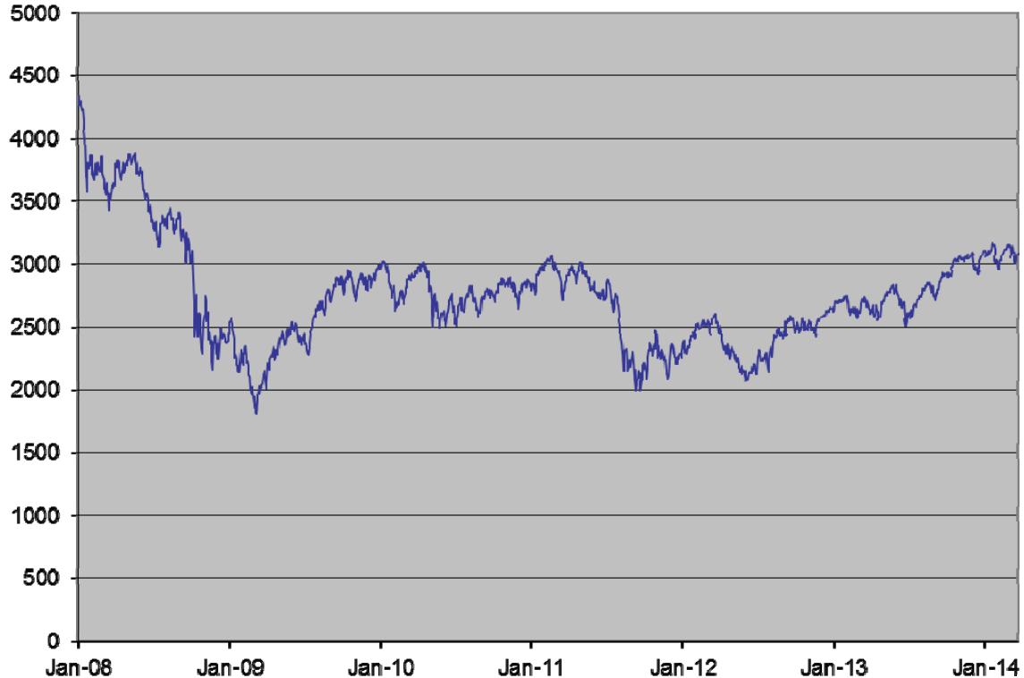
Historical Performance of the SX5E

The historical levels of the Reference Asset should not be taken as an indication of future performance, and no assurance can be given as to the Official Closing Level on the Final Valuation Date. We cannot give you assurance that the performance of the Reference Asset will result in the return of any of your initial investment.