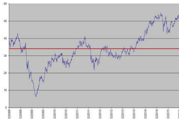
The Dow Chemical Company – Daily Closing Prices January 1, 2008 to August 21, 2015

*The red solid line indicates the downside threshold level.