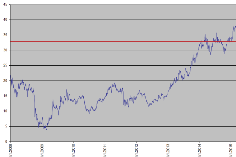
The Blackstone Group L.P. – Daily Closing Prices January 1, 2008 to April 15, 2015

*The red solid line indicates the hypothetical downside threshold level, assuming the closing price of the underlying shares on April 15, 2015 were the initial share price.