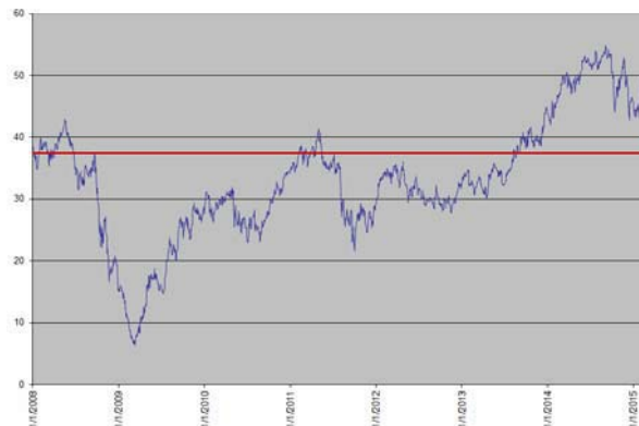
The Dow Chemical Company – Daily Closing Prices January 1, 2008 to March 11, 2015

*The red solid line indicates the hypothetical downside threshold level, assuming the closing price of the underlying shares on March 11, 2015 were the initial share price.