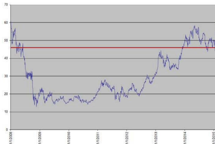
Valero Energy Corporation – Daily Closing Prices January 1, 2008 to February 25, 2015

*The red solid line indicates the hypothetical downside threshold level, assuming the closing price of the underlying shares on February 25, 2015 were the initial share price.