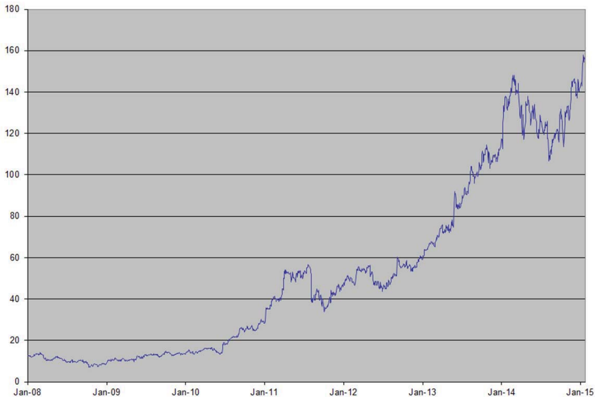
Historical Performance of Valeant Pharmaceuticals International, Inc.

The graph below illustrates the performance of Valeant Pharmaceuticals International, Inc.'s common stock from January 1, 2008 through January 20, 2015, based on closing price information from the Bloomberg Professional® service. The Official Closing Price of the Reference Asset on January 20, 2015 was $156.05. Past performance of the Reference Asset is not indicative of its future performance.