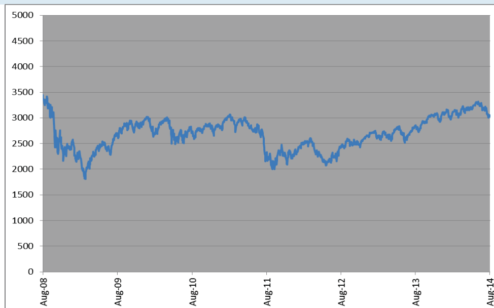
EURO STOXX 50 ® Index Daily Closing Levels August 15, 2008 to August 15, 2014

The following graph sets forth the historical performance of the EURO STOXX 50 ® Index based on the daily historical closing levels from August 15, 2008 through August 15, 2014. The closing level for the EURO STOXX 50 ® Index on August 15, 2014 was 3,033.52. We obtained the closing levels below from the Bloomberg Professional ® service. We have not independently verified the accuracy or completeness of the information obtained from the Bloomberg Professional ® service. The historical levels of the EURO STOXX 50 ® Index should not be taken as an indication of future performance, and no assurance can be given as to the level of the EURO STOXX 50 ® Index on the valuation date.