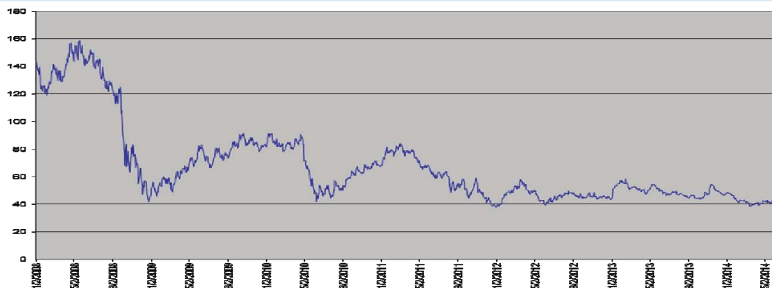
Shares of Transocean Ltd. – Daily Closing Prices January 1, 2008 to June 11, 2014