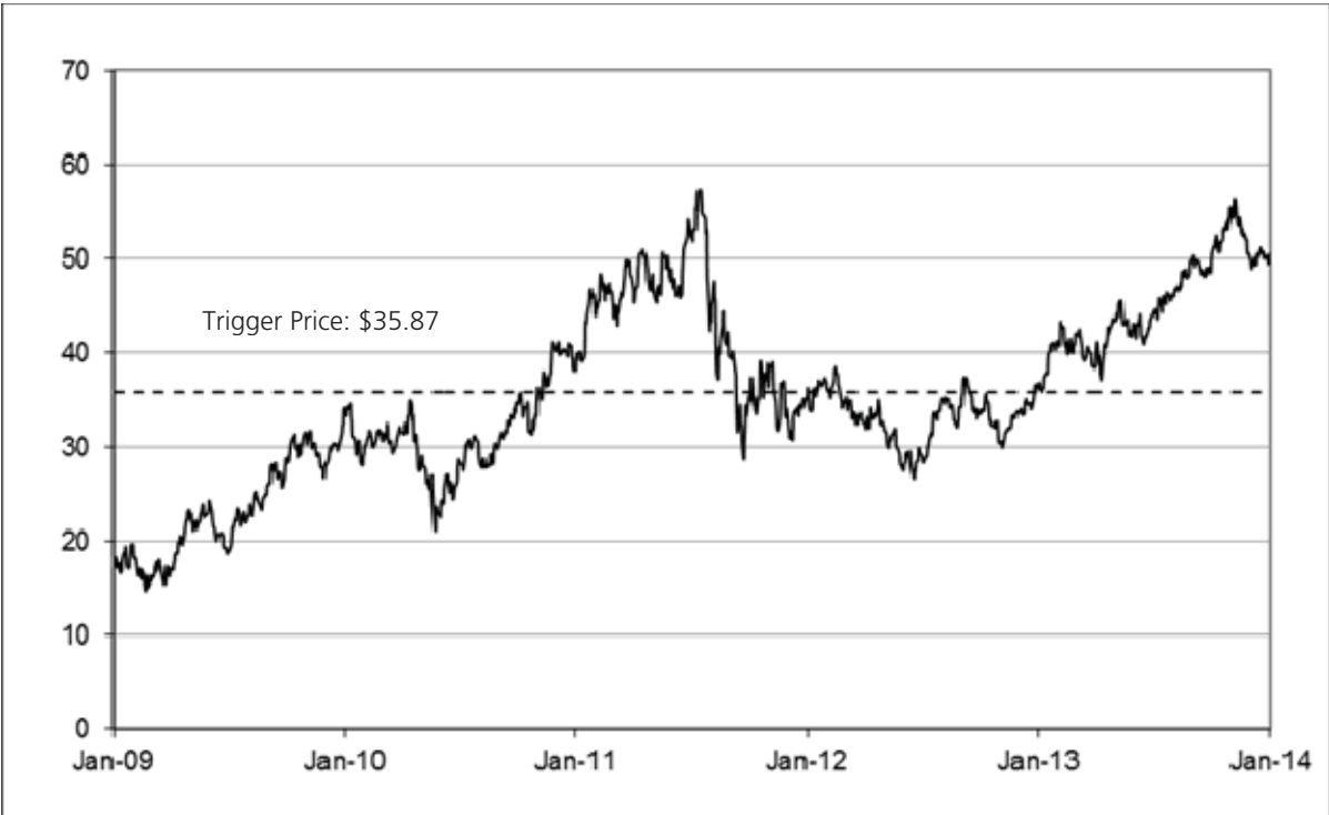
Historical Performance of the Common Stock of Halliburton Company

The graph below illustrates the performance of HAL from January 10, 2009 through January 10, 2014, based on information from Bloomberg. The dotted line represents the Trigger Price equal to 71.00% of the Official Closing Price on January 10, 2014. Past performance of the Underlying Stock is not indicative of its future performance.