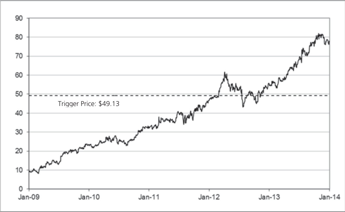
Historical Performance of the Common Stock of Starbucks Corporation

The graph below illustrates the performance of SBUX from January 10, 2009 through January 10, 2014, based on information from Bloomberg. The dotted line represents the Trigger Price equal to 63.25% of the Official Closing Price on January 10, 2014. Past performance of the Underlying Stock is not indicative of its future performance.