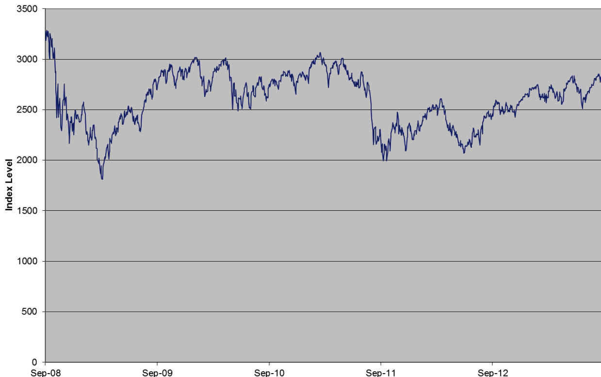
Historical Performance of the SX5E Index

The historical levels of the Reference Asset should not be taken as an indication of future performance, and no assurance can be given as to the Official Closing Level at any time during the term of the Notes. We cannot give you assurance that the performance of the Reference Asset will result in the return of any of your initial investment.