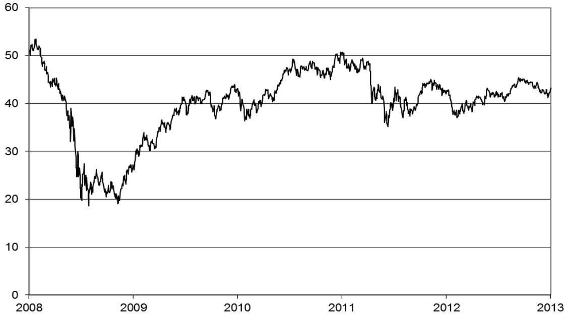
The Official Closing Price of the Index Fund on April 25, 2013 was $43.17

The following graph sets forth the historical performance of the Index Fund based on the daily historical closing prices from April 25, 2008 to April 25, 2013, as reported on the Bloomberg Professional® service. We have not undertaken any independent review of, or made any due diligence inquiry with respect to, the information obtained from the Bloomberg Professional® service. The historical prices of the Index Fund should not be taken as an indication of future performance. Furthermore, due to the transition described above, the Index Fund's historical performance may be of limited value in assessing its performance. As of January 2013, the performance of the Index Fund resulted from its tracking of the Transition Underlying Index. Prior to January 2013, the performance of the Index Fund resulted from its tracking of the MSCI Emerging Markets Index.