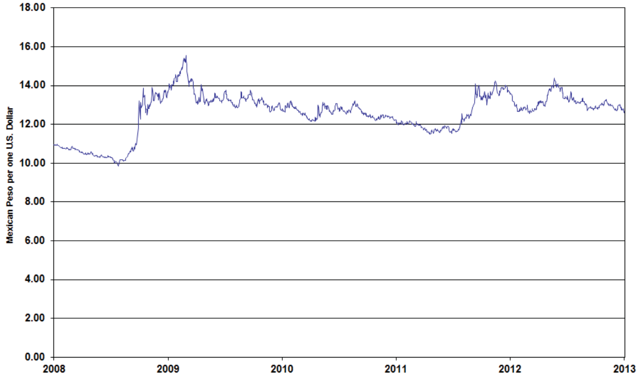
Historical Performance of the Mexican Peso (expressed as the number of Mexican Pesos per one U.S. Dollar)

The historical exchange rates should not be taken as an indication of future performance, and no assurance can be given as to the exchange rate on the Final Valuation Date. We cannot give you assurance that the performance of the Reference Currency will result in the return of any of your initial investment. The closing exchange rates in the graph below were the rates reported by the Bloomberg Professional® service and may not be indicative of the Reference Currency performance using the Spot Rates of the Reference Currency that would be derived from the applicable Reuters page that will be used to calculate the Reference Currency Return.