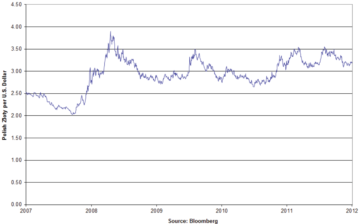
Historical Performance of the Polish Zloty (expressed as the number of Polish Zloty per U.S. Dollar)

The historical exchange rates should not be taken as an indication of future performance, and no assurance can be given as to the exchange rate on the Final Valuation Date. We cannot give you assurance that the performance of the Reference Currency will result in the return of any of your initial investment. The closing exchange rates in the graph below were the rates reported by the Bloomberg Professional ® service and may not be indicative of the Reference Currency performance using the Spot Rates of the Reference Currency that would be derived from the applicable Reuters page that will be used to calculate the Reference Currency Return.