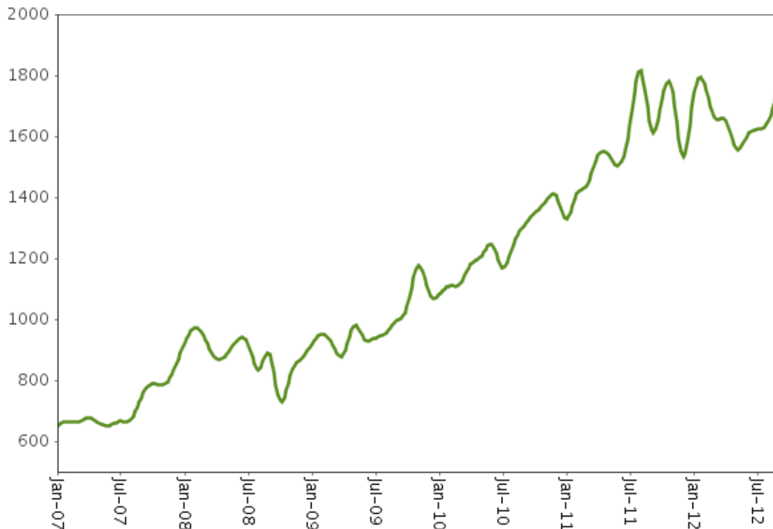
Historical Performance of the Gold Spot Price

This historical data on the Gold Spot Price is not necessarily indicative of the future performance of the Gold Spot Price or what the value of the notes may be. Any historical upward or downward trend in the Gold Spot Price during any period set forth above is not an indication that the Gold Spot Price is more or less likely to increase or decrease at any time over the term of the notes.