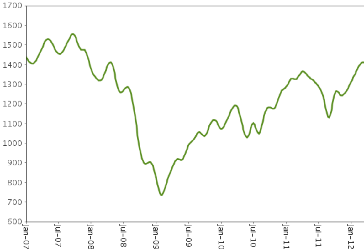
Historical Performance of the Index

This historical data on the Index is not necessarily indicative of the future performance of the Index or what the value of the notes may be. Any historical upward or downward trend in the level of the Index during any period set forth above is not an indication that the level of the Index is more or less likely to increase or decrease at any time over the term of the notes.