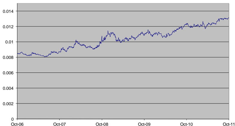
Historical Performance of the Japanese Yen (expressed as the number of U.S. dollars per one Japanese Yen)