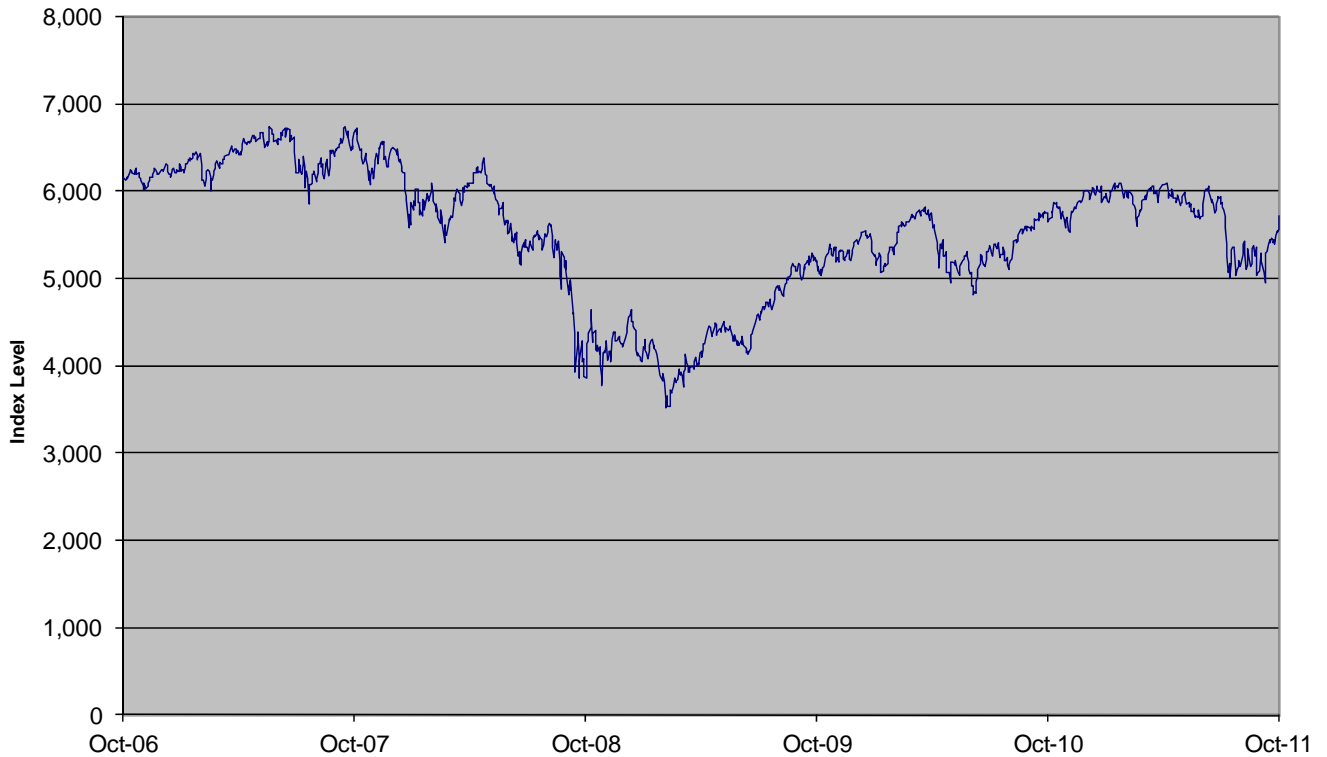
Historical Performance of the FTSE™ 100 Index

The historical levels of the UKX should not be taken as an indication of future performance, and no assurance can be given as to the closing level on the Ending Averaging Dates. We cannot give you assurance that the performance of the UKX will result in the return of any of your initial investment.