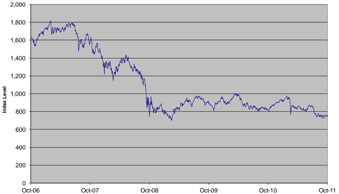
Historical Performance of the Tokyo Stock Price Index