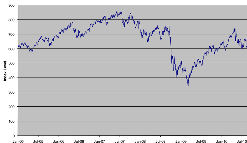
Historical Performance of the Russell 2000 ® Index