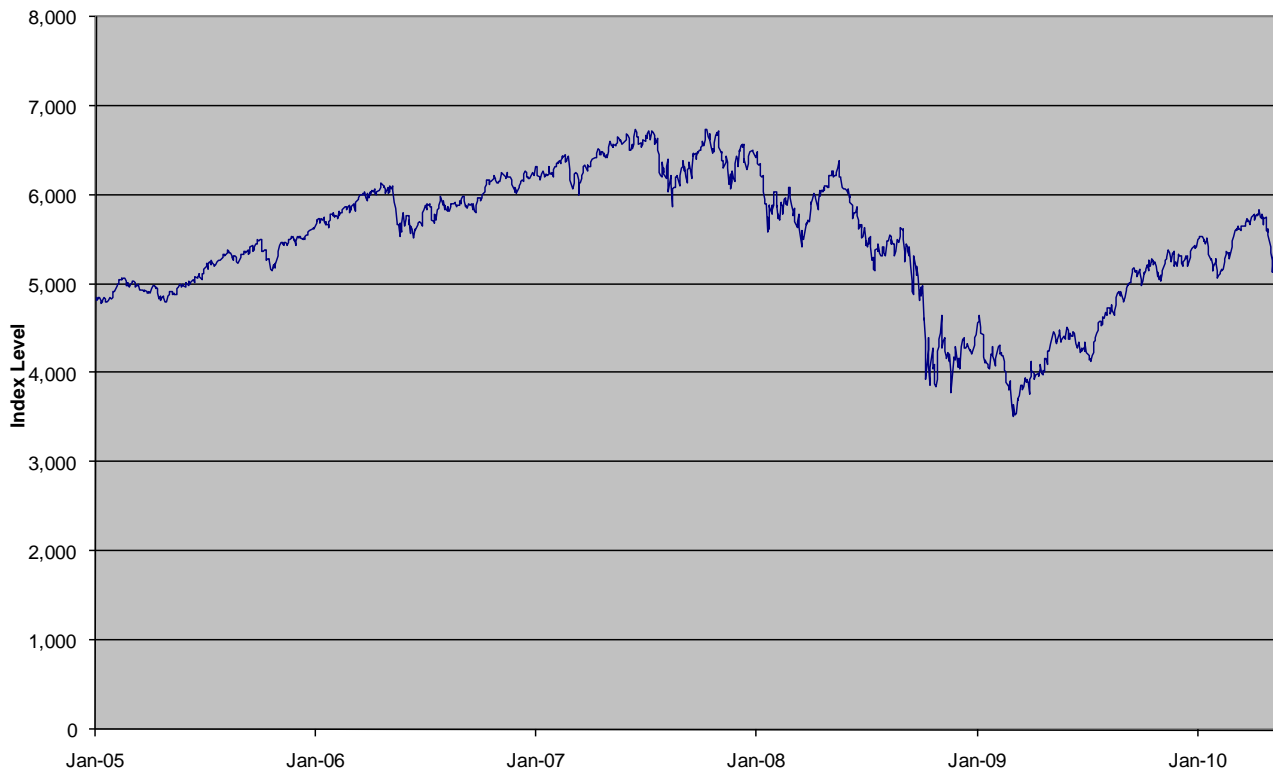
Historical Performance of the FTSE 100™ Index

The historical levels of the UKX should not be taken as an indication of future performance, and no assurance can be given as to the closing level on the Final Valuation Date. We cannot give you assurance that the performance of the UKX will result in the return of any of your initial investment.