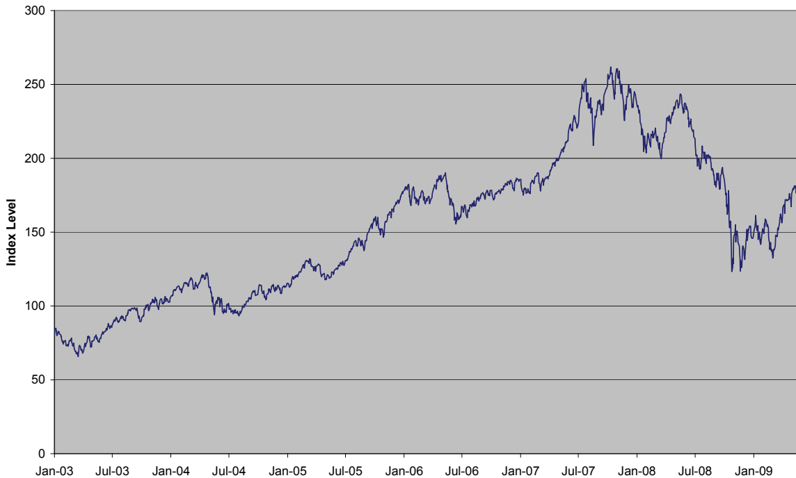
Historical Performance of the Korea Stock Price Index 200

The historical levels of the KOSPI2 should not be taken as an indication of future performance, and no assurance can be given as to the closing level on the final valuation date. We cannot give you assurance that the performance of the KOSPI2 will result in the return of any of your initial investment.