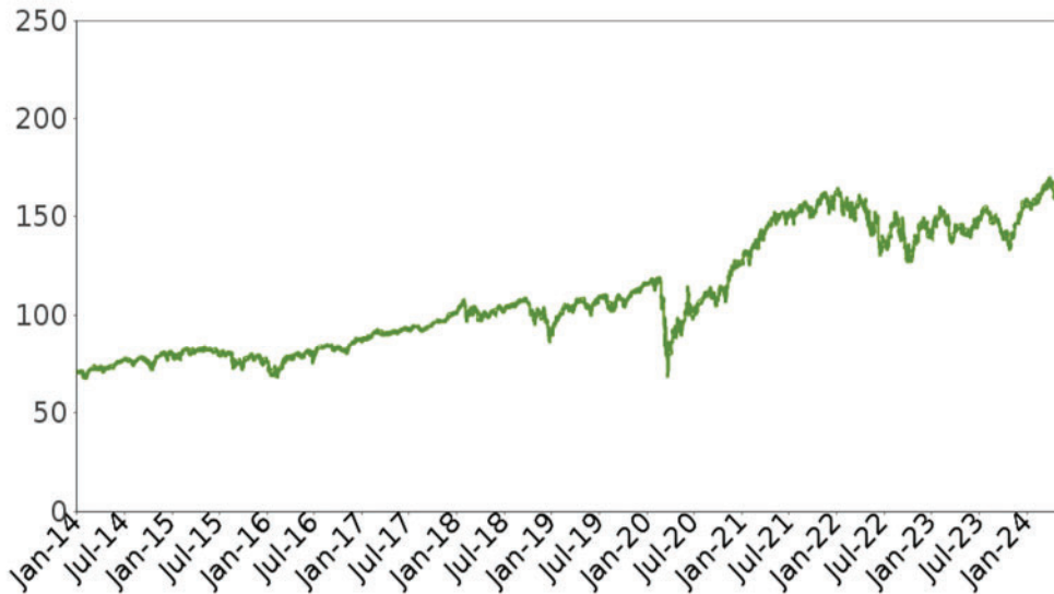
Historical Performance of the Underlying Fund

This historical data on the Underlying Fund is not necessarily indicative of the future performance of the Underlying Fund or what the value of the notes may be. Any historical upward or downward trend in the price per share of the Underlying Fund during any period set forth above is not an indication that the price per share of the Underlying Fund is more or less likely to increase or decrease at any time over the term of the notes.