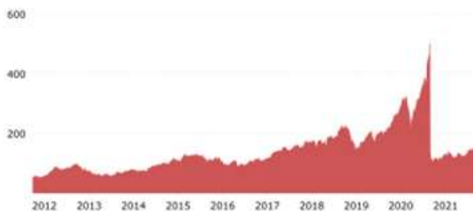
Historical Performance of the common stock of Apple Inc.

The graph below illustrates the performance of AAPL from September 24, 2011 through September 24, 2021, based on closing price information from Bloomberg. Past performance of the Reference Stock is not indicative of its future performance.