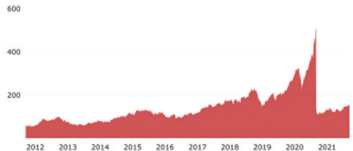
The graph above illustrates the daily performance of this Underlying from September 13, 2011 through September 13, 2021. The closing values in the graph above were obtained from the Bloomberg Professional® Service. Past performance is not necessarily an indication of future results.

Apple Inc. designs, manufactures, and markets personal computers and related personal computing and mobile communication devices along with a variety of related software, services, peripherals, and networking solutions. Apple Inc. sells its products worldwide through its online stores, its retail stores, its direct sales force, third-party wholesalers, and resellers. Shares of the common stock of Apple Inc. trade and are listed on the Nasdaq Global Select Market under the symbol "APPL."