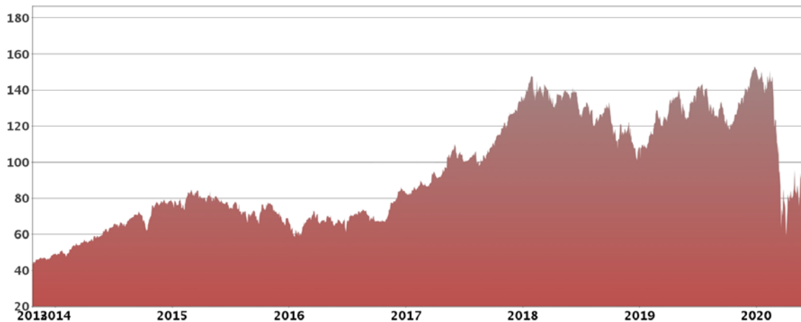
Historical Performance of MAR

The historical prices of MAR should not be taken as an indication of future performance, and no assurance can be given as to the Official Closing Prices on the Averaging Dates. We cannot give you assurance that the performance of MAR will result in the return of any of your initial investment.